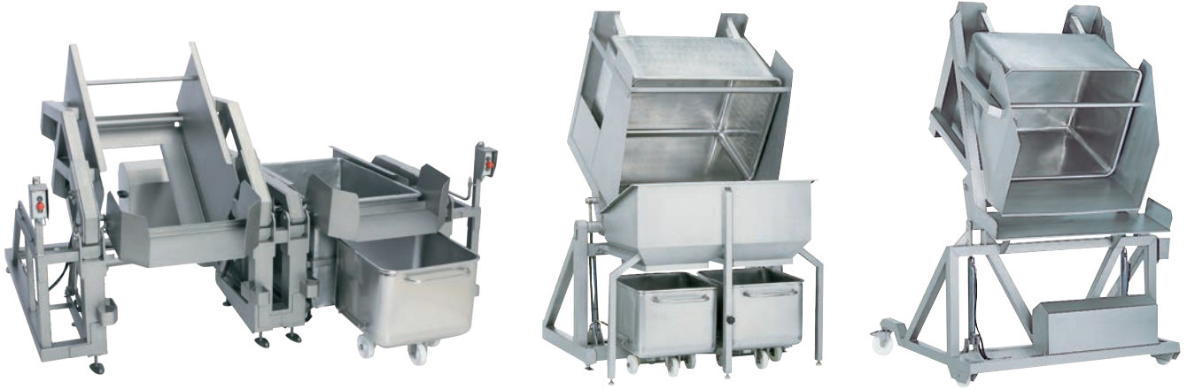
Double-Swing-Loader type 27200