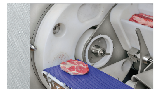
The rotating chamber system allows the continuous infeed of the raw material.