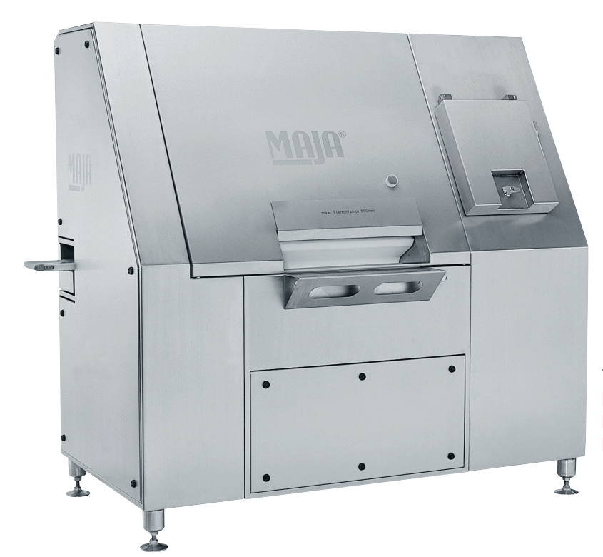
The perfect solution! MAJA FP 100: Fresh meat Portioning