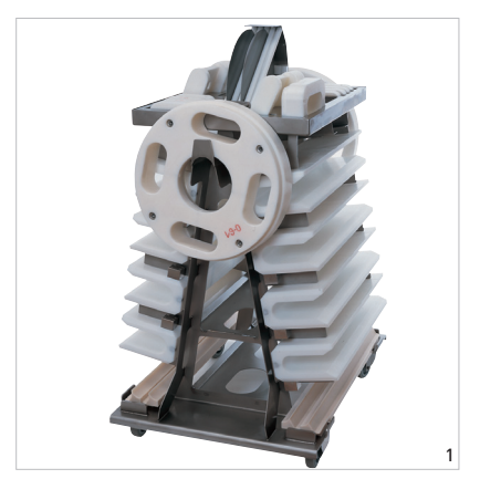
Pict. 1: Mobile tool cart