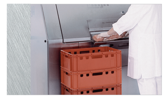
Ergonomic working height for infeed of