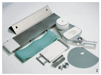
Pict. 2: Calibration sets